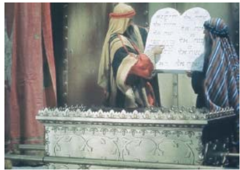
The Ten Commandments were placed in the Ark.

The first four deal with our love to God, and the last six deal with our love for our fellowman. They can be divided into these two sections. There is one underlying principle behind these commands – LOVE. In these commands we see a transcript of God's character: "God is love". At first they may appear to be a list of "don'ts, but when a Christian is motivated by love, he wants to please God and respect his fellowman.