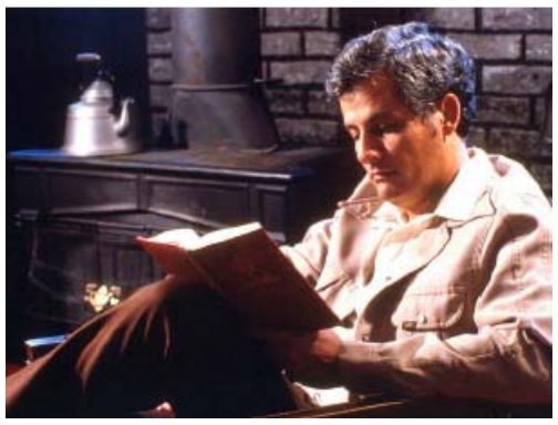
God will write His law on our hearts.

Hebrews 5:9 And having been perfected, He became the author of eternal salvation TO ALL WHO OBEY HIM,