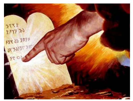
The Ten Commandments were written with God's own finger. The only part of the Bible written directly by God!

The whole Bible has been written by man, yet inspired by God. The Ten Commandments, however, were written by God Himself. Surely He must have regarded them very highly.