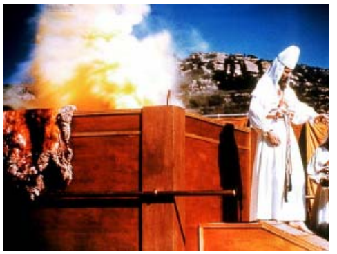
The sacrificial ceremonies were fulfilled at the cross and blotted out.

Colossians 2:14-17 HAVING WIPED OUT THE HANDWRITING OF REQUIREMENTS that was against us, which was contrary to us. And He has taken it out of the way, HAVING NAILED IT TO THE CROSS. Having disarmed principalities and powers, He made a public spectacle of them, triumphing over them in it. So let no one judge you in FOOD or in DRINK, or regarding a FESTIVAL or a new moon or sabbaths, which are a shadow of things to come, but the substance is of Christ.