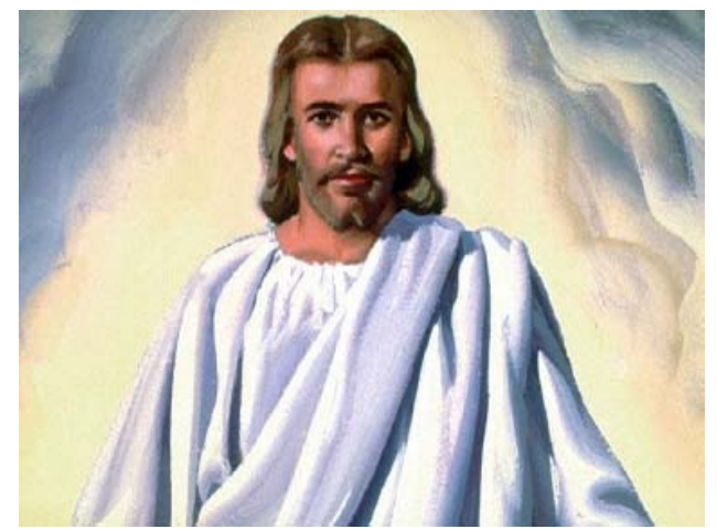
Those who love Jesus will keep His commandments.

The test of love is obedience. Friend, do you love Jesus enough to obey Him? Remember, He loved you enough to die for you. His plea to you today is to keep His commandments. They are not grievous – in fact to keep them, will keep you out of trouble in this life, and bring you happiness. God's way of willing obedience is the best way, and if Jesus is supreme in your life, He will give you the strength to keep the commandments of God.