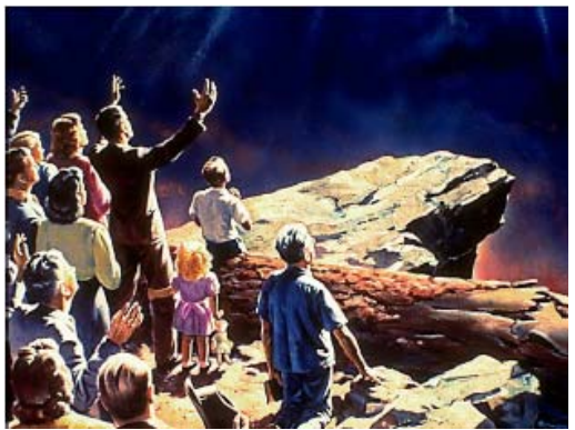
Revelation 14 says that God's people in the last days will keep God's commandments.

Psalm 111:7,8 The works of His hands are verity and justice; all His precepts are sure. THEY STAND FAST FOREVER AND EVER, and are done in truth and uprightness.