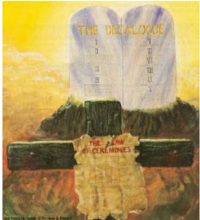
The 10 Commandments stand forever but the ceremonial law was nailed to the cross.

When God led the children of Israel out of Egyptian bondage, He delivered to them in fiery majesty the Ten Commandments. This holy law was spoken by God, written by God, recorded on tables of stone, and is of eternal duration. At the same time another law, of temporary usage, was also delivered to the children of Israel. This law dealt with the ceremonial rites of the Jewish sanctuary service, and concerned itself with a system of religion that passed away at the cross. Large sections of Exodus, Leviticus, Numbers and Deuteronomy describe in detail this temporary ceremonial code. This Law can easily be identified in the Scriptures. It talks about circumcision (a religious Jewish rite), sacrifices, offerings, purifications, ceremonial holy days, and other rites associated with the Hebrew sanctuary service.